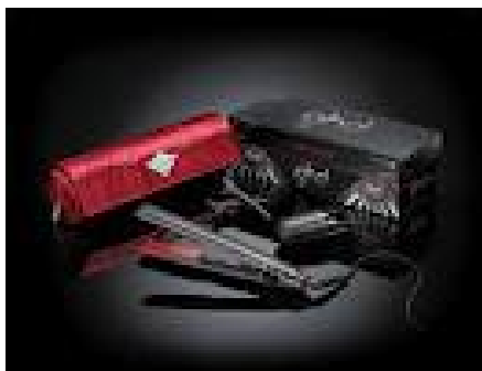
GHD Deluxe Scarlet £149